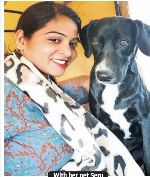
With her pet Seru