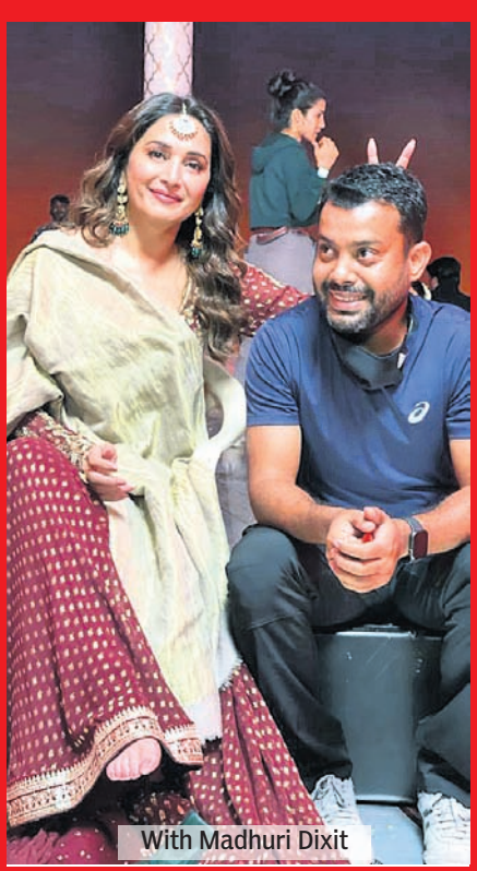
With Madhuri Dixit