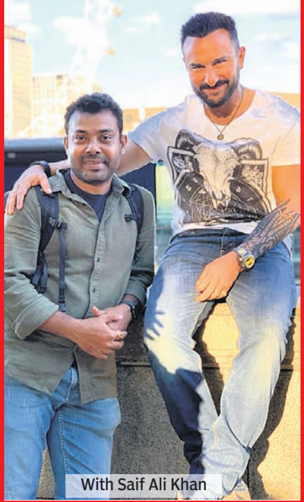
With Saif Ali Khan

At present, I am working on the Netflix series Mismatch Season 2 starring Prajakta Koli aka Mostly Sane from YouTube. Then, there is an untitled movie of Karan Johar's Dharma productions. I am also shooting for Uunchai , directed by Sooraj R Barjatya, with an ensemble cast that includes Amitabh Bachchan, Anupam Kher, Parineeti Chopra, Boman Irani, Neena Gupta, Sarika and Danny Denzongpa.