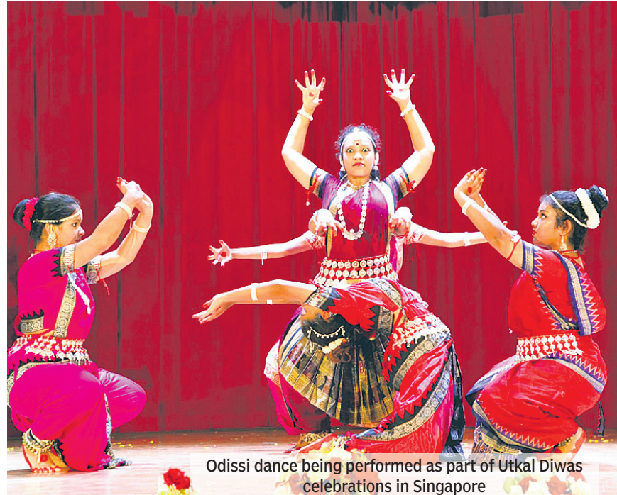
Odissi dance being performed as part of Utkal Diwas celebrations in Singapore

Whether they live in Singapore, Dubai or California, the members of Odia diasporas always promote their distinct culture by celebrating all popular festivals of the state and Odisha Day is no exception