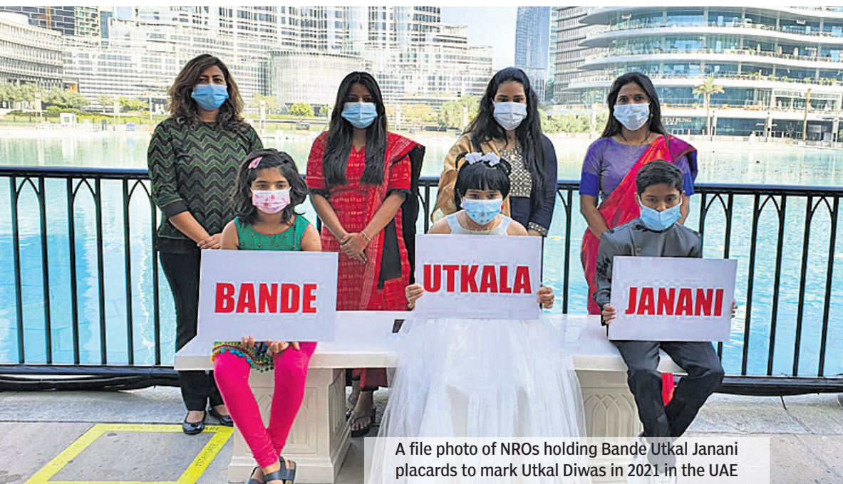
A file photo of NROs holding Bande Utkal Janani placards to mark Utkal Diwas in 2021 in the UAE