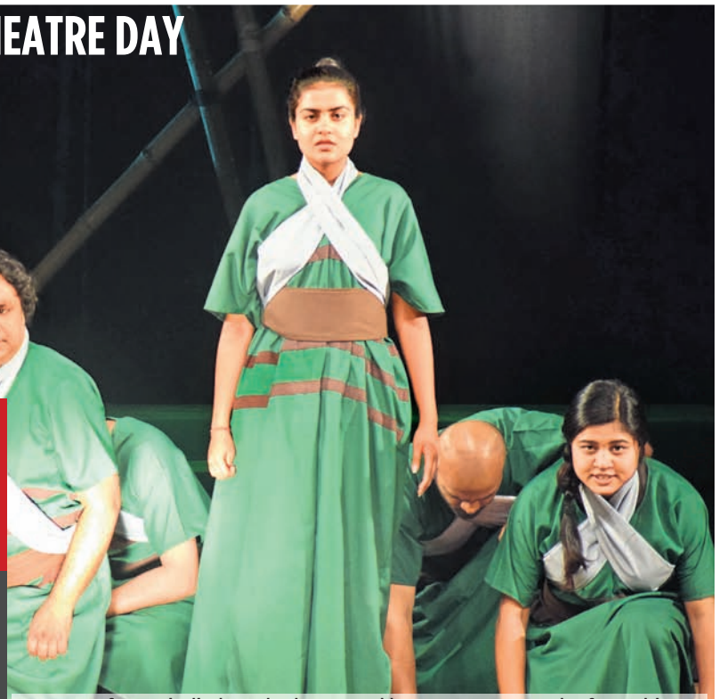
A scene from Hindi play Ulgulan staged by Yuva Rangmanch of Ranchi at Rabindra Mandap during 24th Kalinga Natya Mahotsav, Bhubaneswar