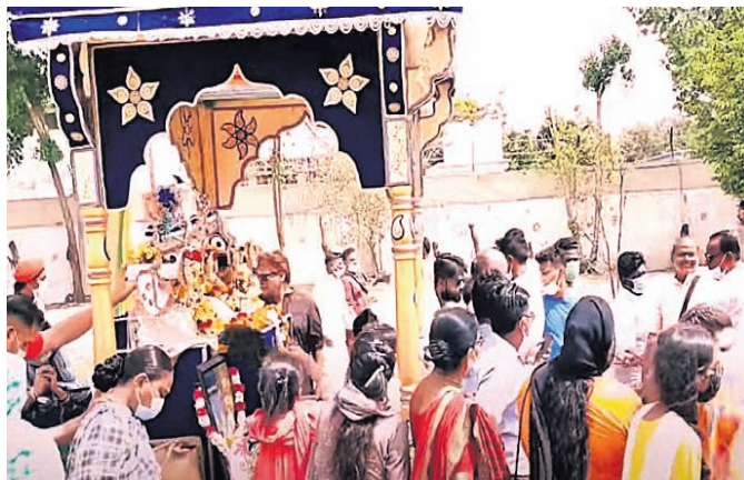
Rath Yatra procession in Karachi