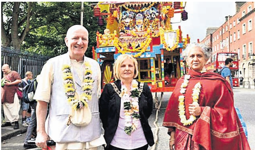
Rath Yatra in Dublin, Ireland