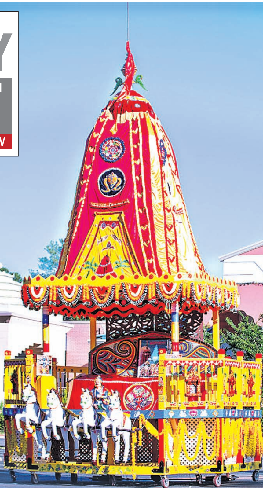
A newly built chariot at North Carolina, USA