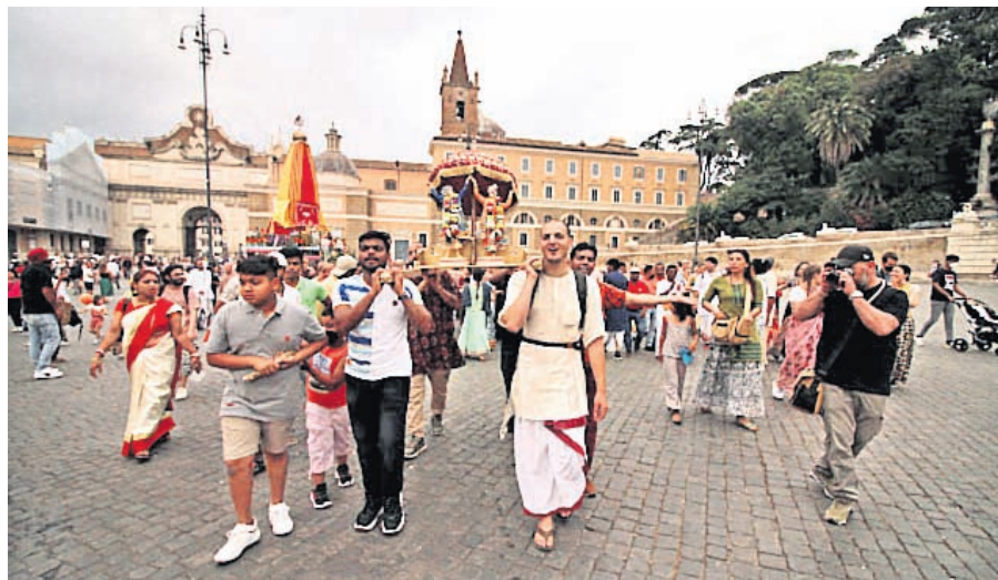
A scene from Rome