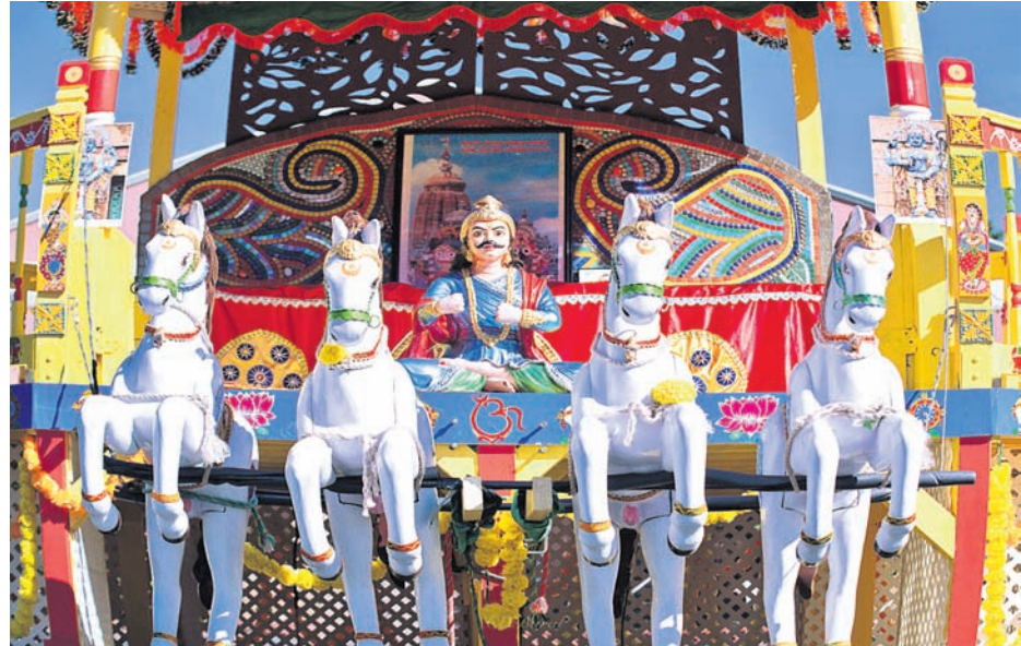
Front view of a chariot at North Carolina, USA

Though the Rath Yatra here has been organised since 2015, the devotees are quite excited this year as the deities will appear in the newly built chariot this year. Unlike in other cities, the festival will be held here July 9, 2022.