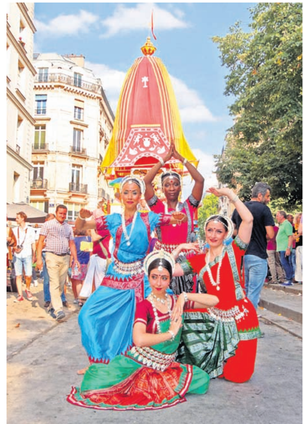
A chariot being pulled in Paris