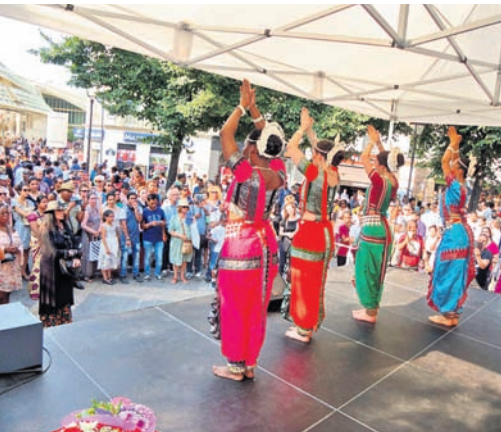
An Odissi recital during Rath Yatra in Paris