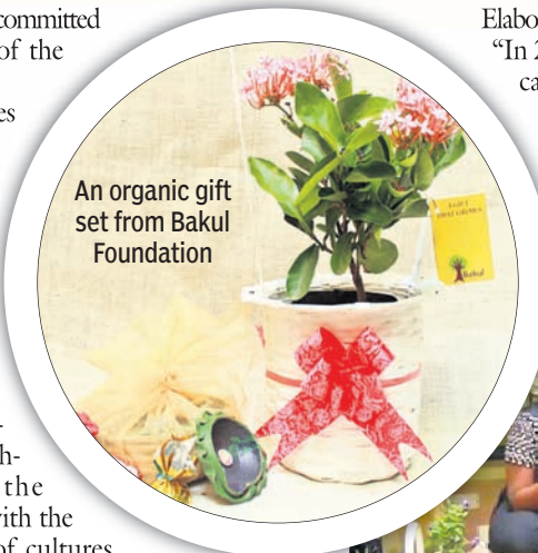
An organic gift set from Bakul Foundation