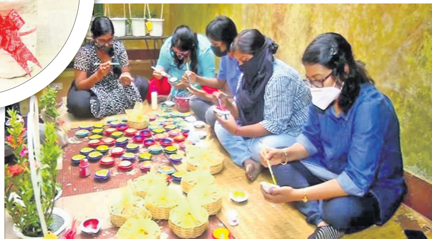
Bakul volunteers at work