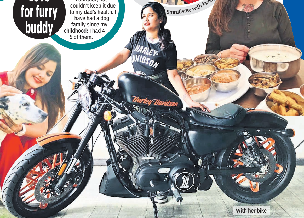
With her bike