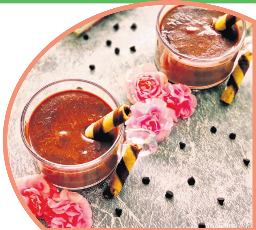
The writer is a well known food blogger of Odisha

There's just nothing quite as comforting as having a hot cocoa on a cold cozy winter day and it's even better when enjoyed with your friends and family. This recipe is a classic creamy version of Hot Chocolate which is rich and luxurious. Real chocolate and not cocoa powder makes this Hot Chocolate creamy, rich and delicious. I make this homemade Hot Chocolate when I feel like having something luxurious to uplift my moods and spirit. I always have a block of baking (cooking) chocolate bars in the fridge and most of the time these bars get used up in making this decadent homemade Hot Chocolate. You can serve some marshmallows along with Hot Chocolate for some extra sweet experiences.