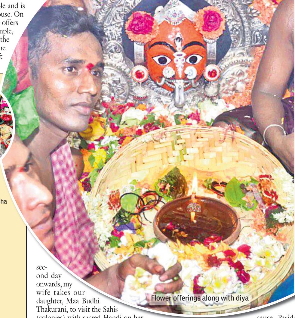
Flower offerings along with diya