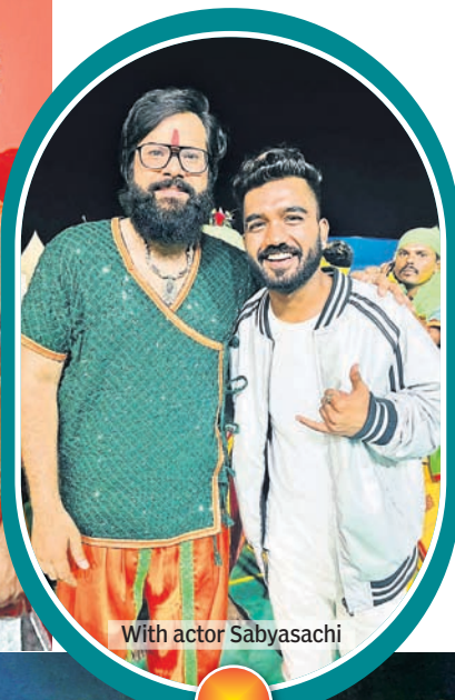
With actor Sabyasachi