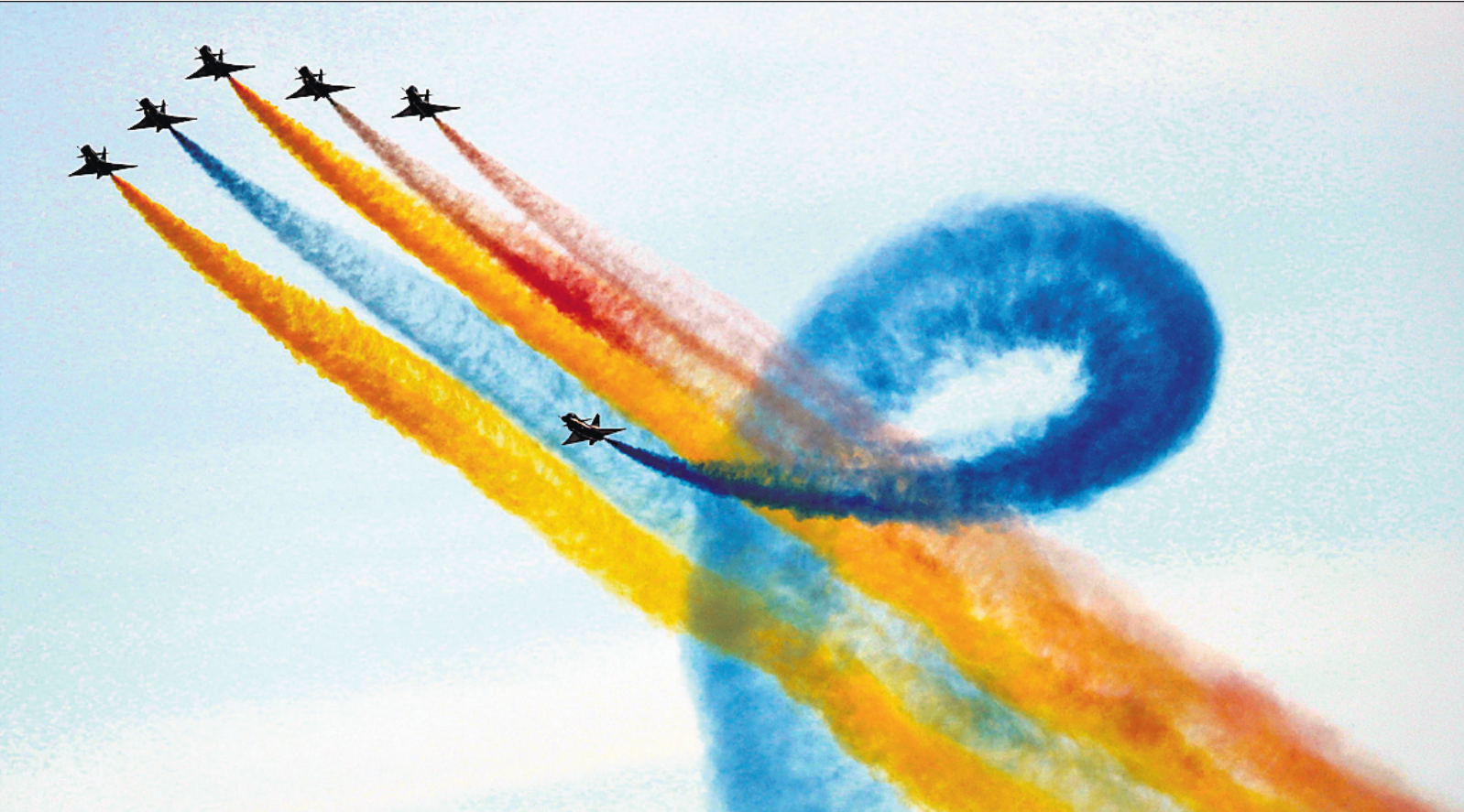
Frecce Tricolori (Tricolor Arrows), the Italian Air Force aerobatic display team, performs during the opening day of the Dubai Air Show, United Arab Emirates