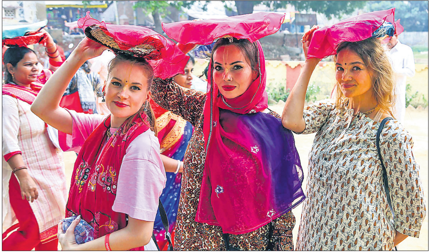
Devotees carrying milk and sweets walk to the Govardhan hillock on the occasion of 'Govardhan puja', near Mathura, Uttar Pradesh