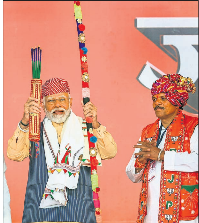
Prime Minister Narendra Modi being felicitated during a poll meeting, in Jhabua district, Madhya Pradesh