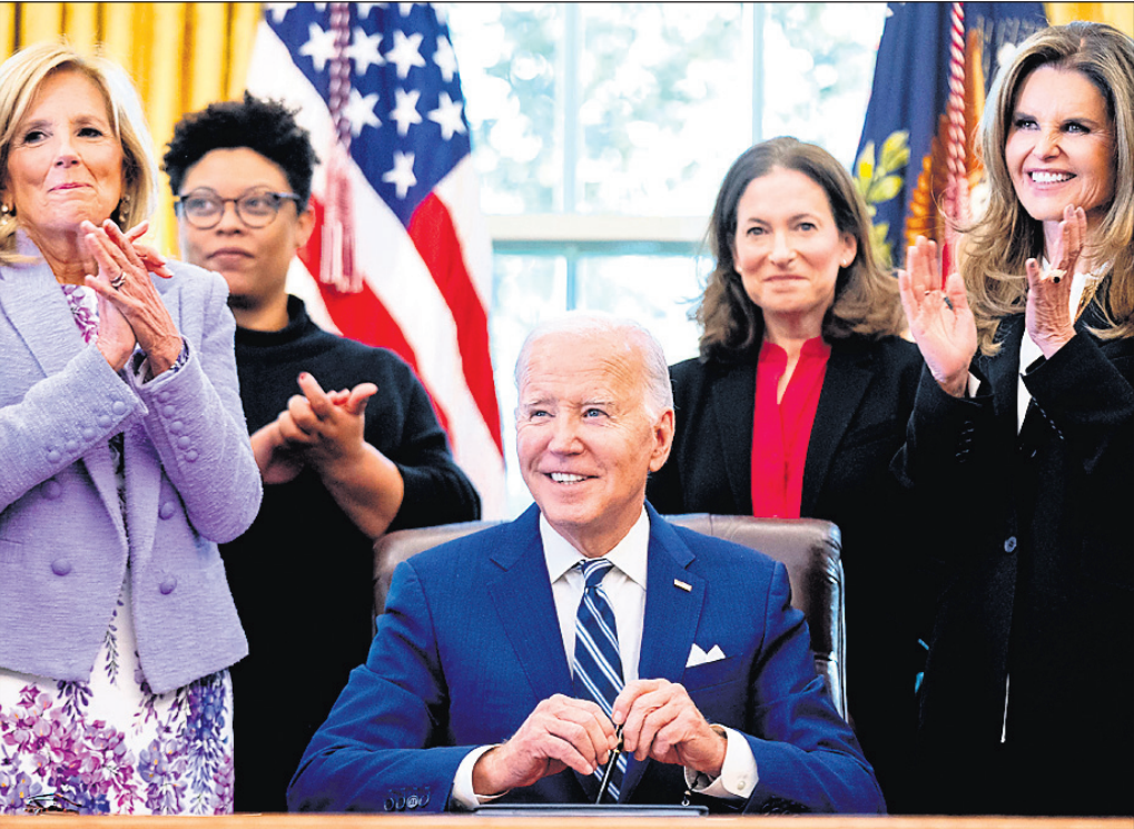
President Joe Biden, accompanied by (from left), first lady Jill Biden, Office of Management and Budget director Shalanda Young, White House Gender Policy Council director Jen Klein, and Women's Alzheimer's Movement founder Maria Shriver, signs a presidential memorandum that will establish the first-ever White House Initiative on Women's Health Research in the Oval Office of the White House