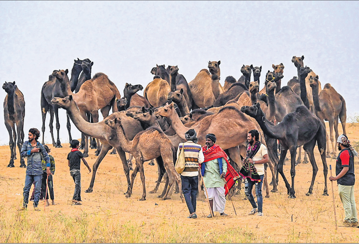
Camel herders arrive ahead of the annual Pushkar Fair, in Pushkar, Rajasthan