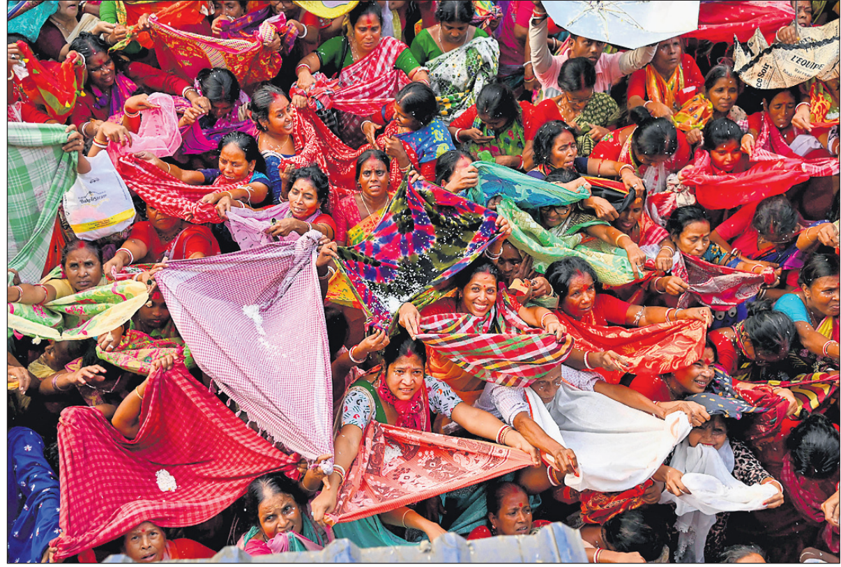
Devotees collect 'Prasad' during Annakut festival at Madan Mohan Temple, in Kolkata, West Bengal