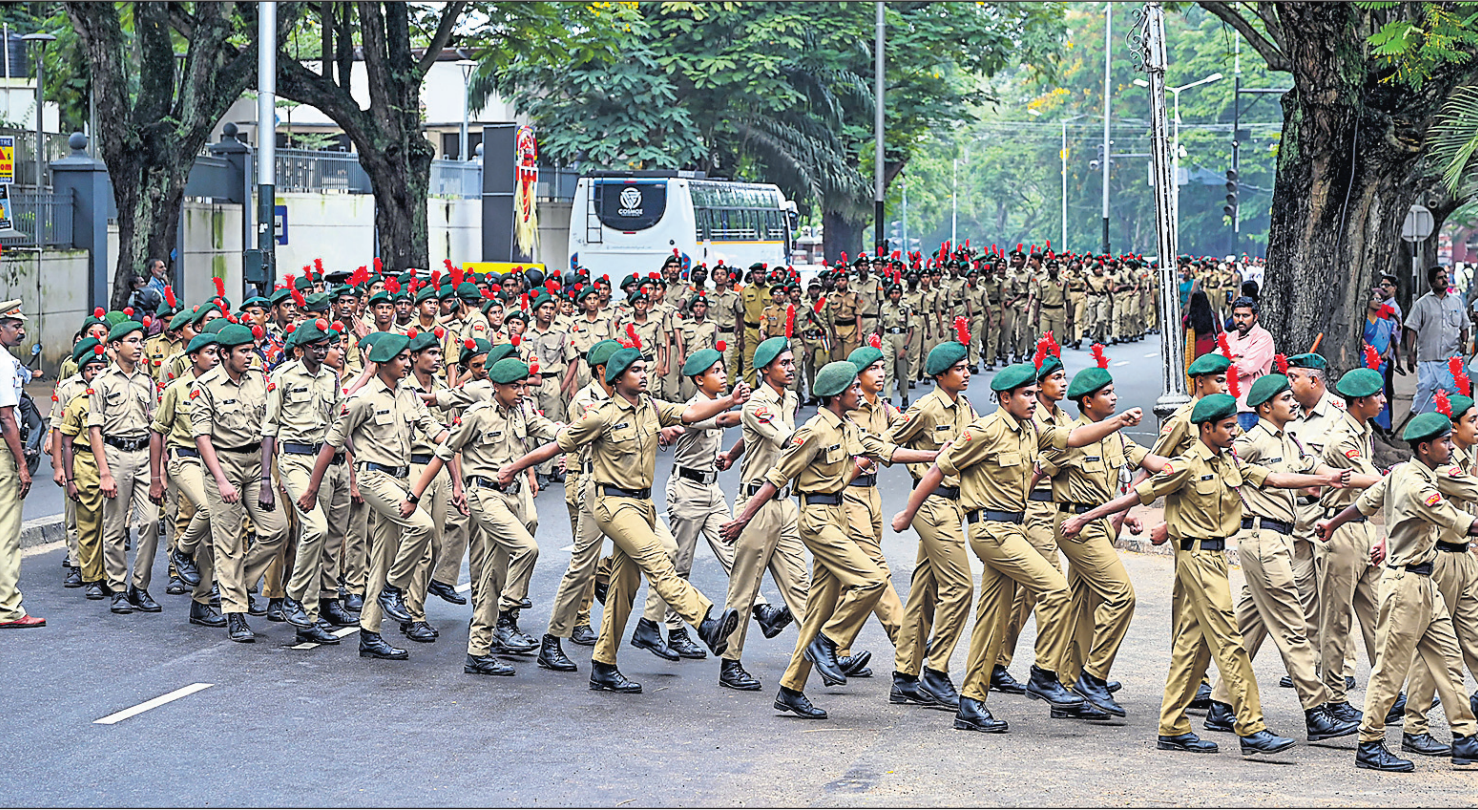
NCC cadets take part in a march past during the Children's Day celebrations, in Thiruvananthapuram, Kerala