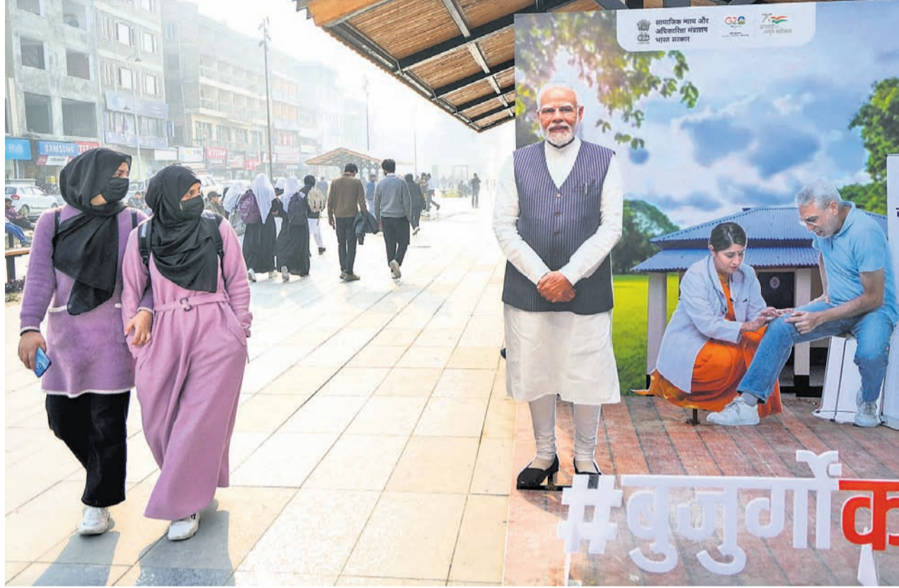
Students look at the life-size cutout of Prime Minister Narendra Modi at Lal Chowk in Srinagar, Wednesday