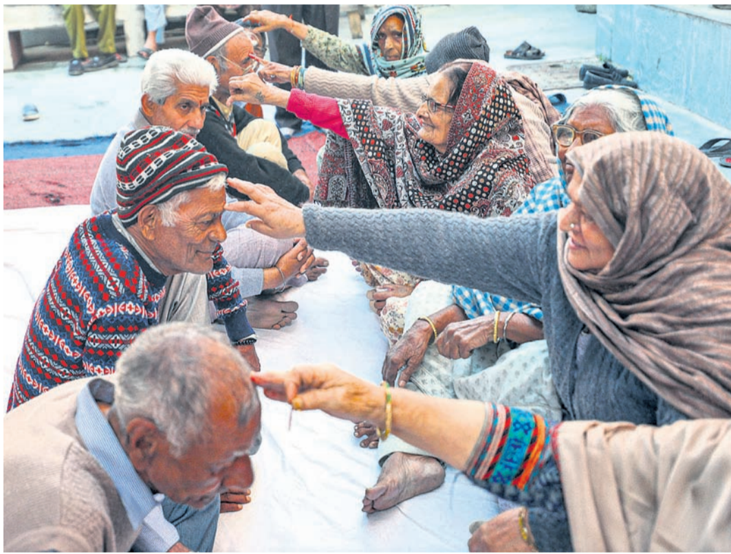
Elderly people at an old age home celebrate 'Bhai Dooj' festival, in Jammu, Wednesday