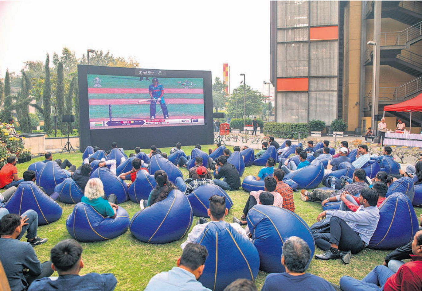
Cricket fans sitting on bean bags watch the WC 2023 cricket semi-final between India and New Zealand on a huge screen at a mall in Noida, Wednesday