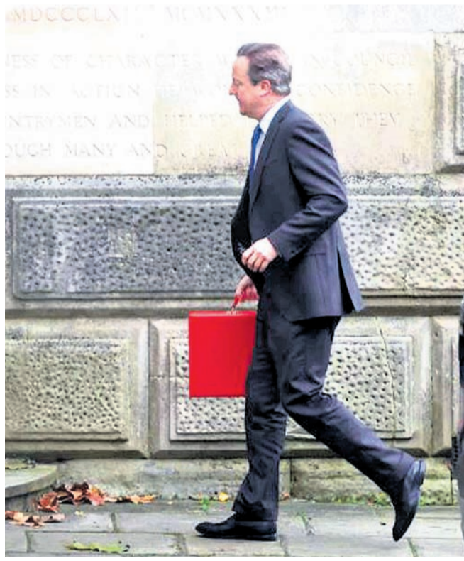
Britain's Foreign Secretary David Cameron arrives at the Foreign, Commonwealth and Development Office in London