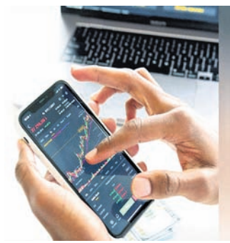
Wipro, Tata Steel, Tata Consultancy Services, Reliance Industries and Axis Bank were

Among the Sensex firms, Tech Mahindra, Tata Motors, Infosys,