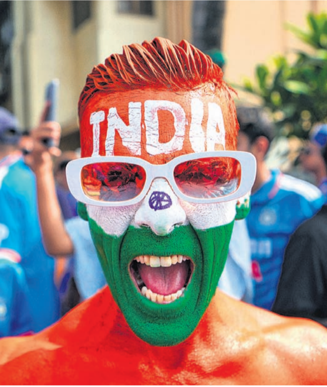
An Indian fan during the ICC Men's Cricket World Cup 2023 semi-final match between India and New Zealand, in Mumbai, Wednesday