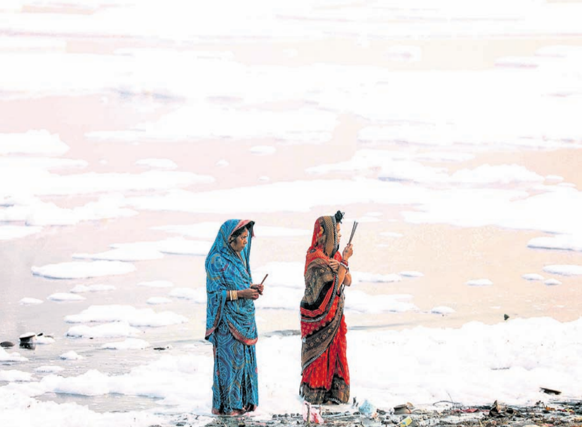
Devotees perform rituals as toxic foam floats on the surface of polluted Yamuna river in New Delhi, Wednesday