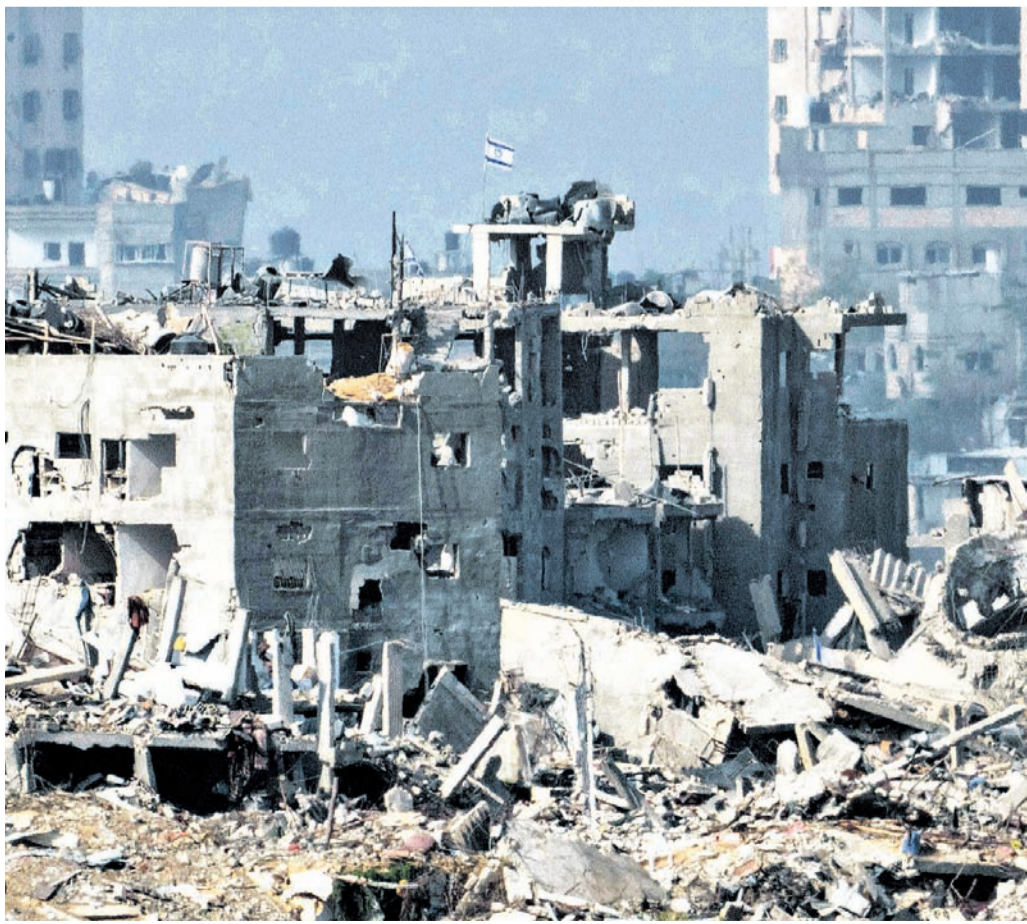
An Israeli flag stands on the top of a destroyed building in the Gaza Strip, as seen from southern Israel, Wednesday. The Israeli military says it has taken control of northern Gaza