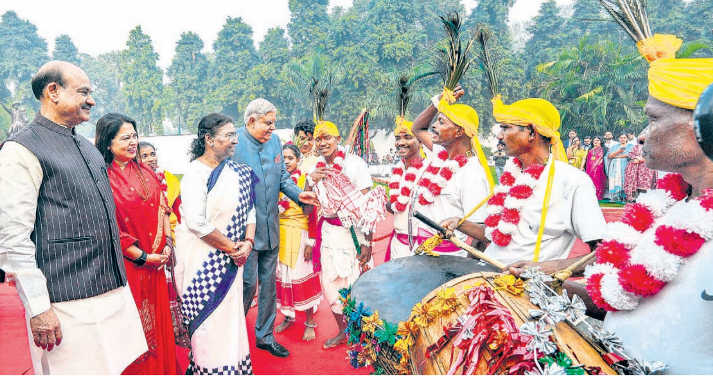
President Droupadi Murmu along with Vice President Jagdeep Dhankhar and others interacts with folk artistes after paying tributes to Bhagwan Birsa Munda during celebration of 'Janjatiya Gaurav Divas' at Parliament House complex, in New Delhi, Wednesday