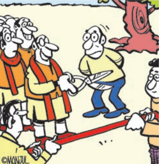
Stone laying, construction, and completion will happen with time. Let me inaugurate the project first