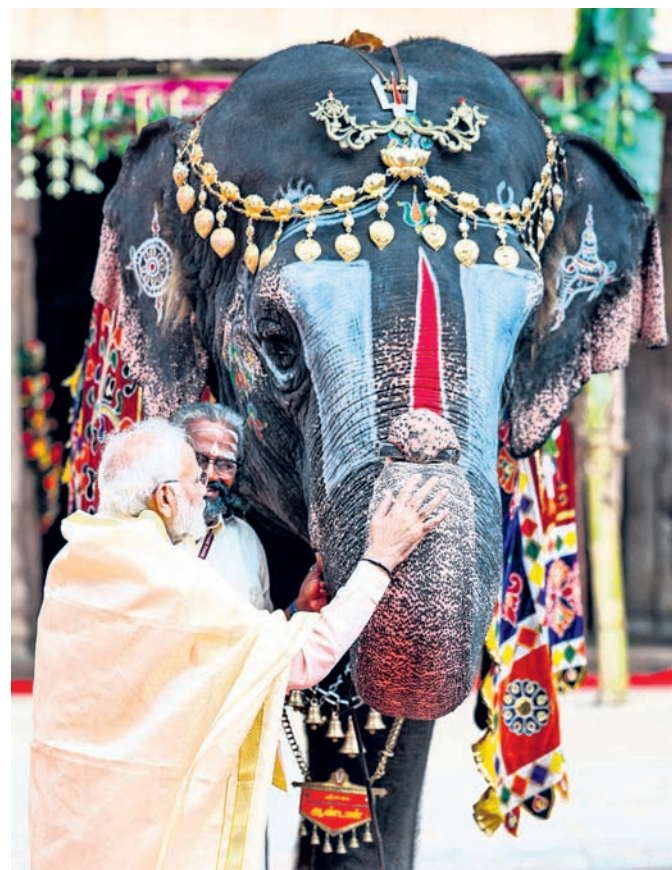
Prime Minister Narendra Modi during his visit to the Sri Ranganathaswamy Temple, in Tiruchirappalli district, Saturday