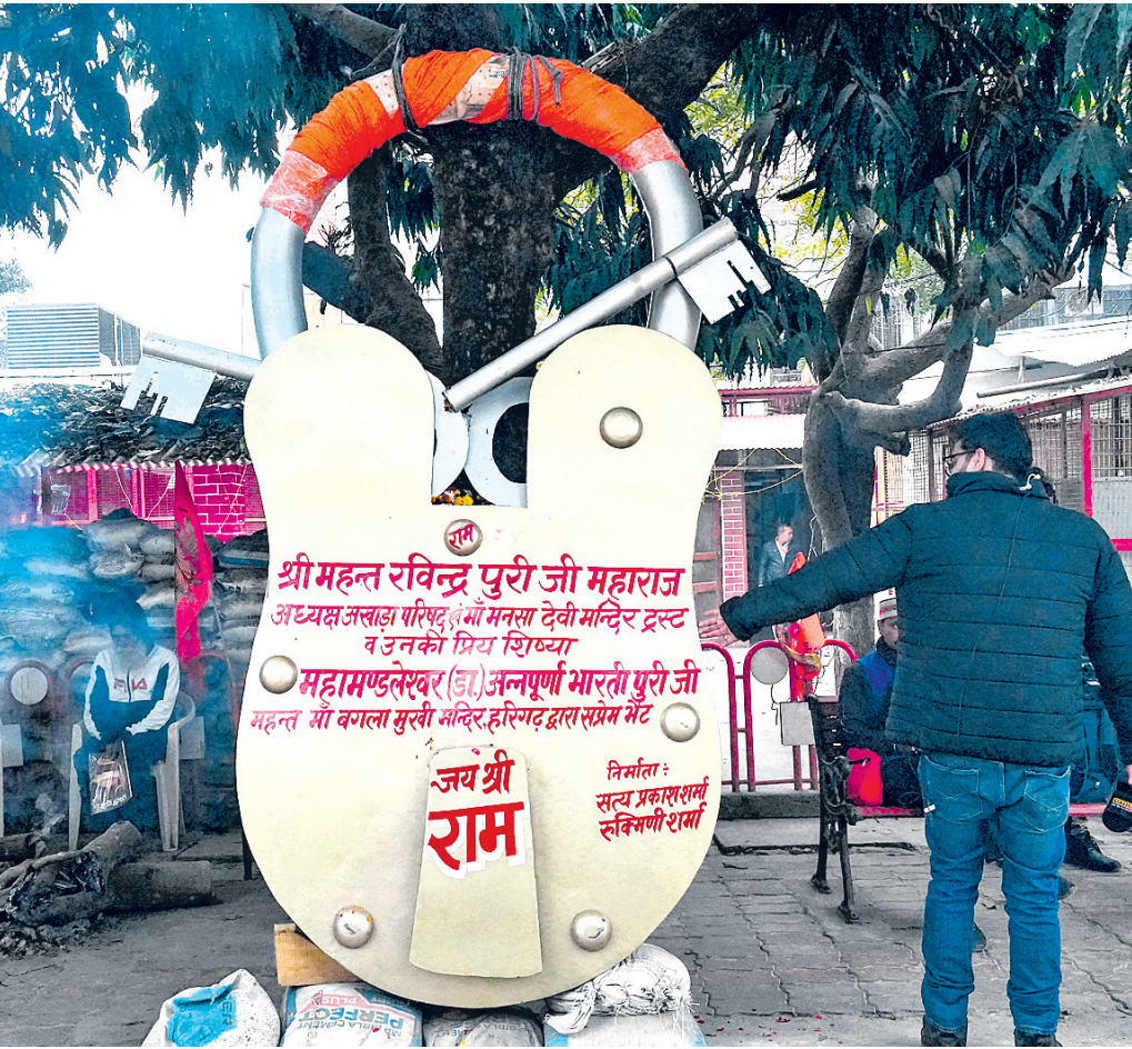
People click pictures with a giant lock ahead of the consecration ceremony of Ram Temple in Ayodhya