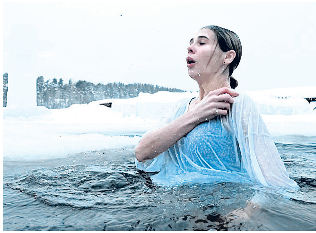
A woman takes a dip in icy water during celebrations of the Orthodox Christian feast of Epiphany in the town of Sertolovo in the Leningrad Region, Russia