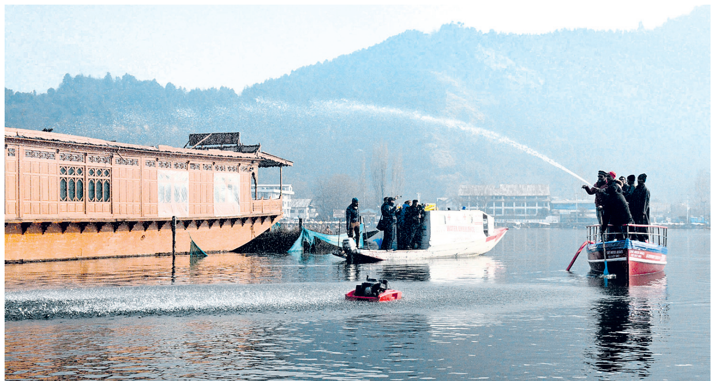
Houseboat owners demonstrate the first-ever fire and emergency services boat during its launch, at Dal Lake in Srinagar