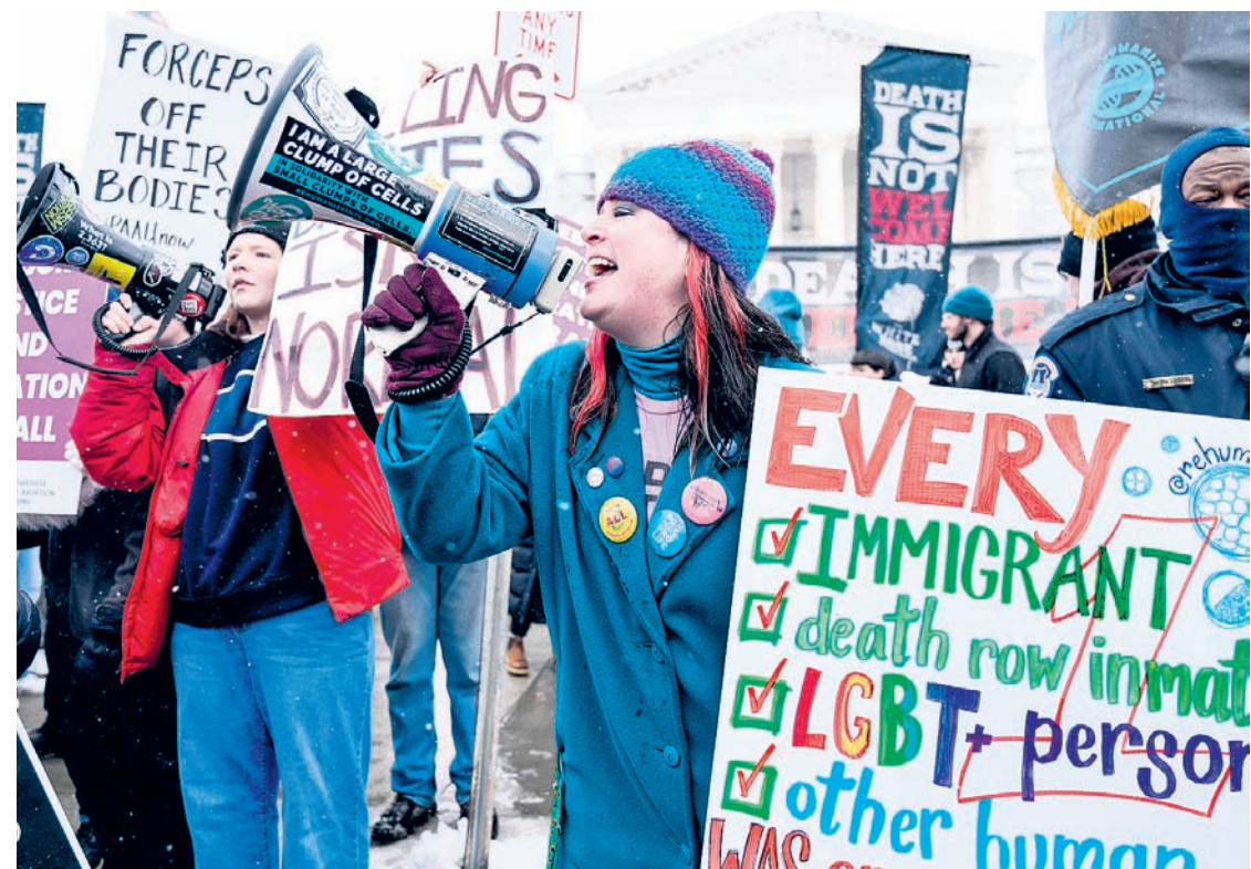
Anti-abortion activists participate in the annual 'March for Life' in front of the Supreme Court in Washington