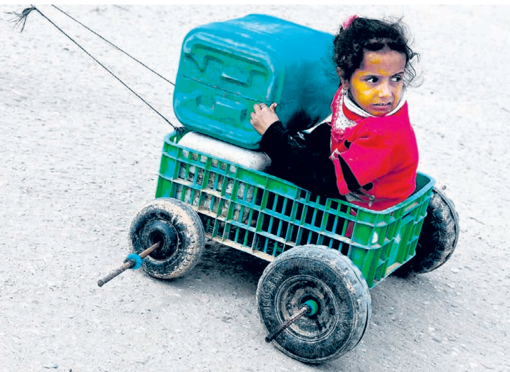
A girl sits in a makeshift cart as Palestinians wait to receive food amid shortages of supplies, in Rafah in the southern Gaza Strip