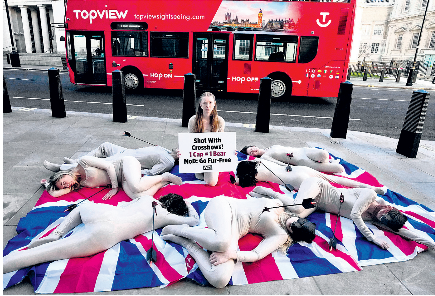
PETA (People for the Ethical Treatment of Animals) supporters lie on a Union Jack flag as they hold a 'die-in' near the Ministry of Defence's headquarters to protest the slaughter of Canadian black bears for purely ornamental bearskin caps in London