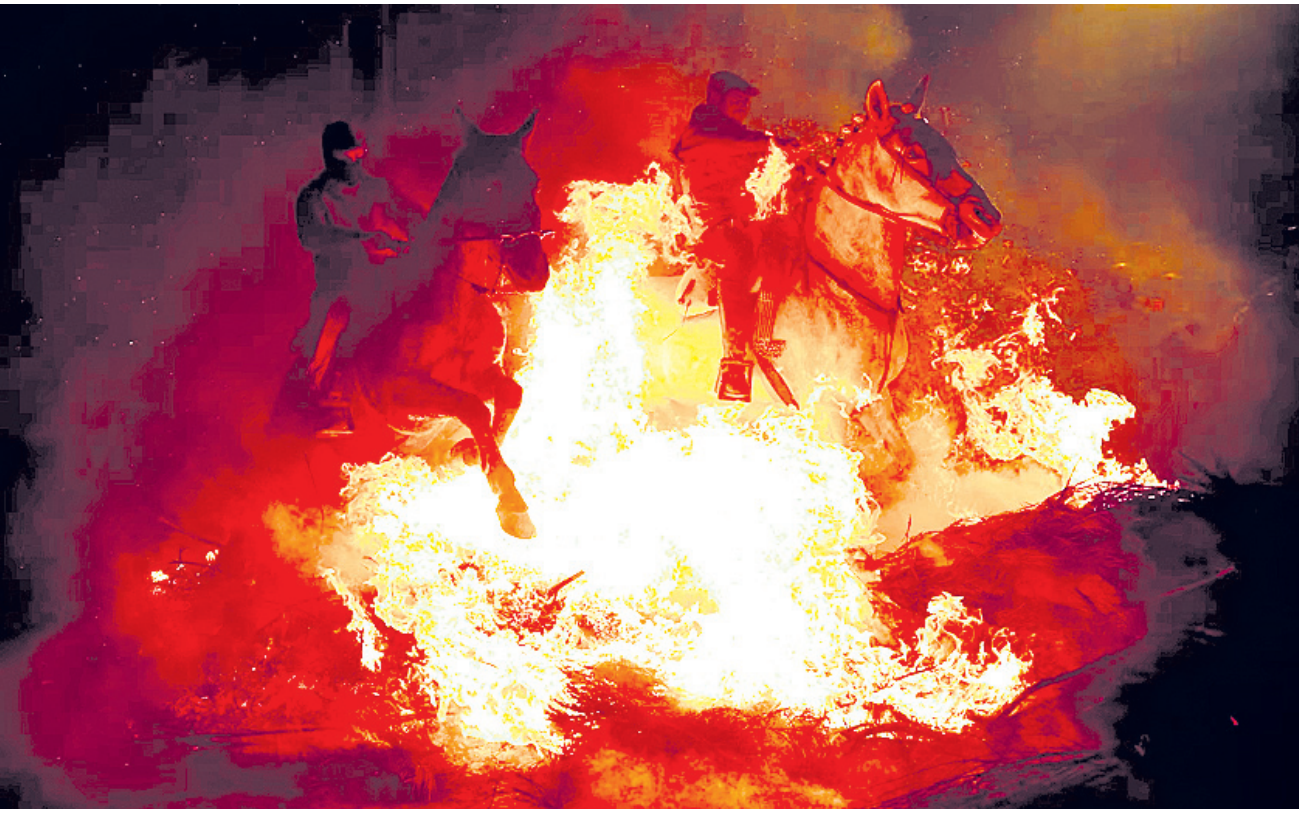
Riders go through flames during the annual 'Luminarias' celebration in the village of San Bartolome de Pinares, northwest of Madrid, Spain