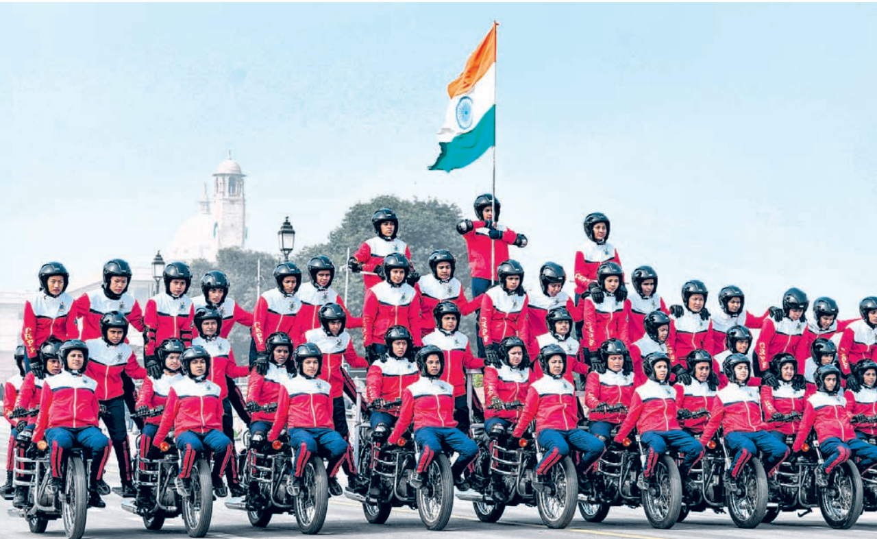
A team of CRPF's 'Daredevils' during rehearsal for the Republic Day parade in New Delhi