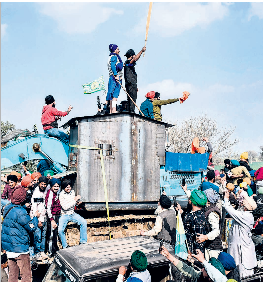
RESOLUTE STAND: Farmers near an excavator modified to shield them from rubber bullets, as they plan to resume their 'Delhi Chalo' march over various demands, including a legal guarantee on the minimum support price for crops and farm loan waiver, at Punjab-Haryana Shambhu border in Patiala district, Tuesday

"We have launched a probe following a suspected murder complaint by the deceased's family," said Sadar IIC Rajkumar Biswal.