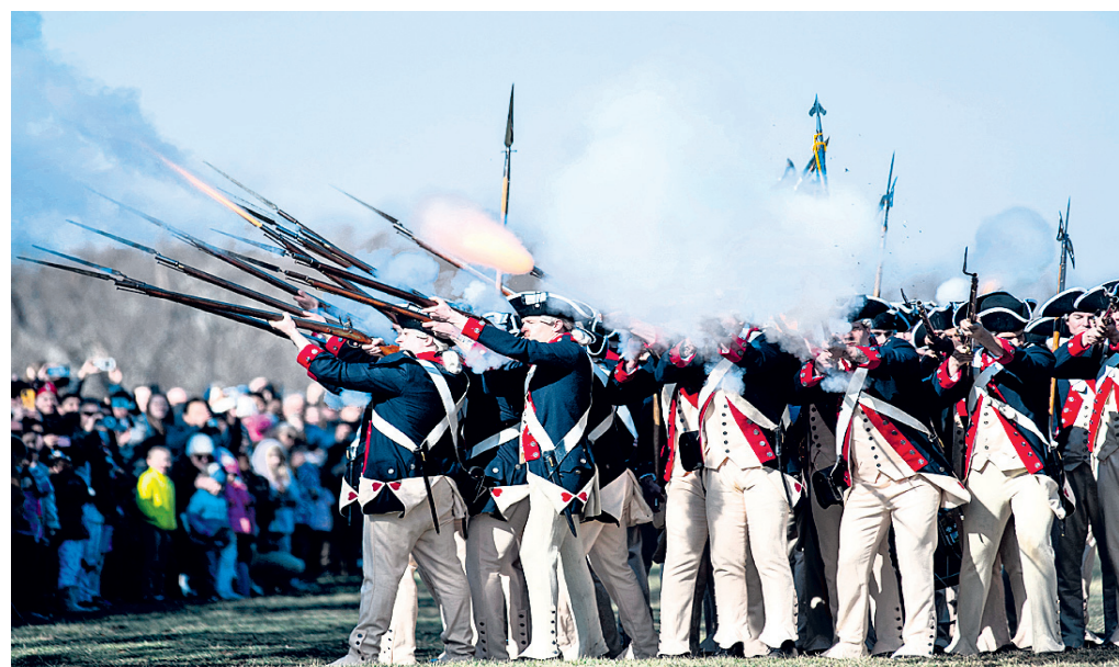
Members of Alpha Company, 3d US Infantry Regiment (The Old Guard), give a firing demonstration on the Bowling Green of George Washington's Mount Vernon Monday, in Mount Vernon, Va. The ceremonies at Mount Vernon were held to honor George Washington's birthday February 22, and President's Day