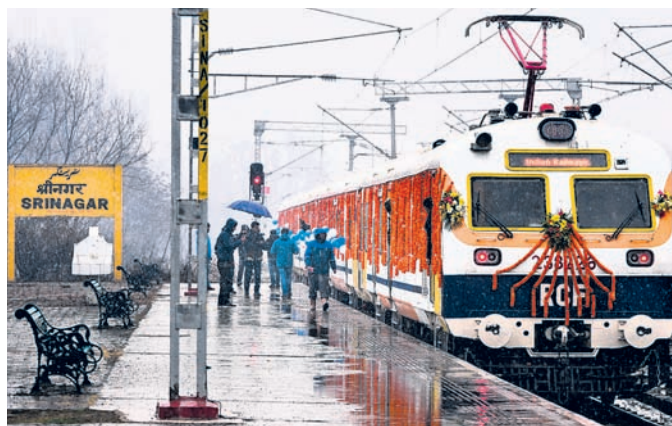
J&K's first electric train during its flagging off ceremony, at Srinagar railway station, in Jammu & Kashmir, Tuesday. Prime Minister Narendra Modi virtually flagged off the train on the newly electrified Baramulla-Srinagar-Banihal-Sangaldan route

made so that the passengers can be brought to the escape tunnel and then, carried to their desired destinations in vehicles," he added. The official said that in order to tackle a fire incident, water pipes have been laid on both sides of the tunnel with an opening valve provided at every 375 metres so that water can be sprayed on a train from both sides to douse the flames. "Escape tunnels have been created for other bigger tunnels too," he said. According to NR officials, the opening of the Banihal-Khari-Sumber-Sangaldan section has brought them a step closer to achieving the dream of running a train from the Kashmir valley in the north to Kanyakumari on the southern tip of the country. "Earlier, eight diesel trains (four each from one side) were operating between Baramulla and Banihal. Today, Prime Minister Modi not only inaugurated the extension of the Banihal route to Sangaldan via Khari and Samber but also flagged off the first electrified trains on the whole route from Baramulla to Sangaldan," the