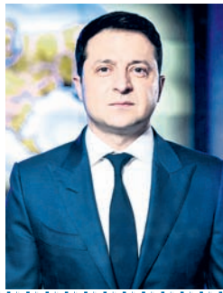
Russians are taking advantage of delays in aid to Ukraine VOLODYMYR ZELENKYY | UKRAINIAN PRESIDENT

GOV.UK LAUNCHES NEW LOGO In a move that symbolises a new royal era for the country, the UK government has updated the logo on its official GOV.UK digital services used across all departments for official day-to-day business with the chosen crown of King Charles III