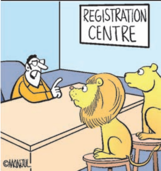
Your species might be same but till we don't ascertain your religions, you can't stay together