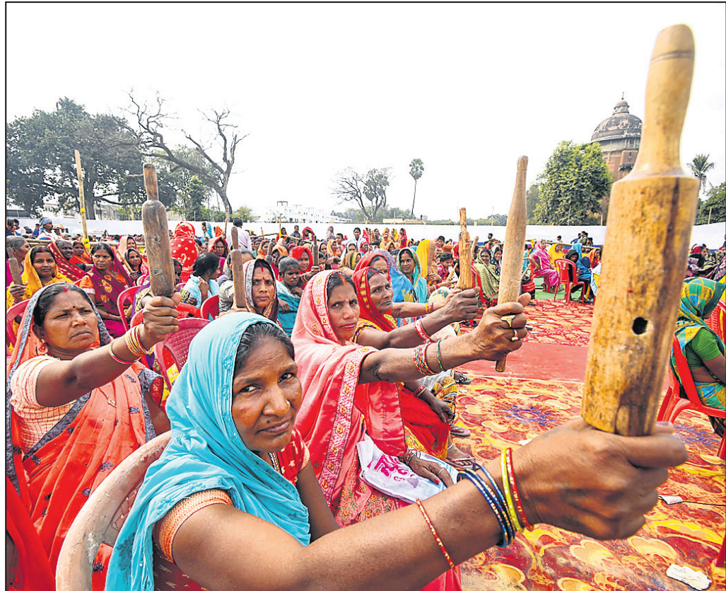
Women from Nonia, Bind and Beldar communities take part in a 'Belan Rally' demanding Scheduled Tribes status for their communities, in Patna