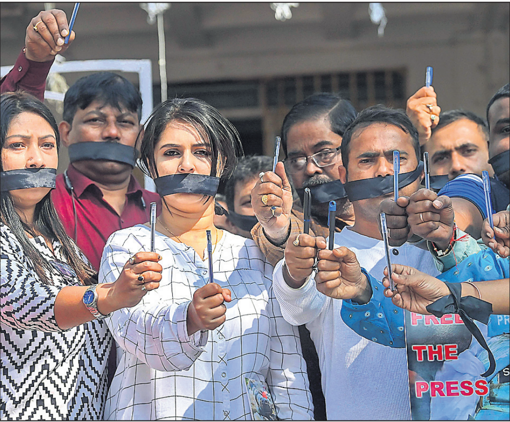
Journalists wearing a black cloth tied on their mouth during their silent protest against killing of journalists on International Day for Palestinian Journalists organised by the Tripura Journalists Union (TJU), in Agartala