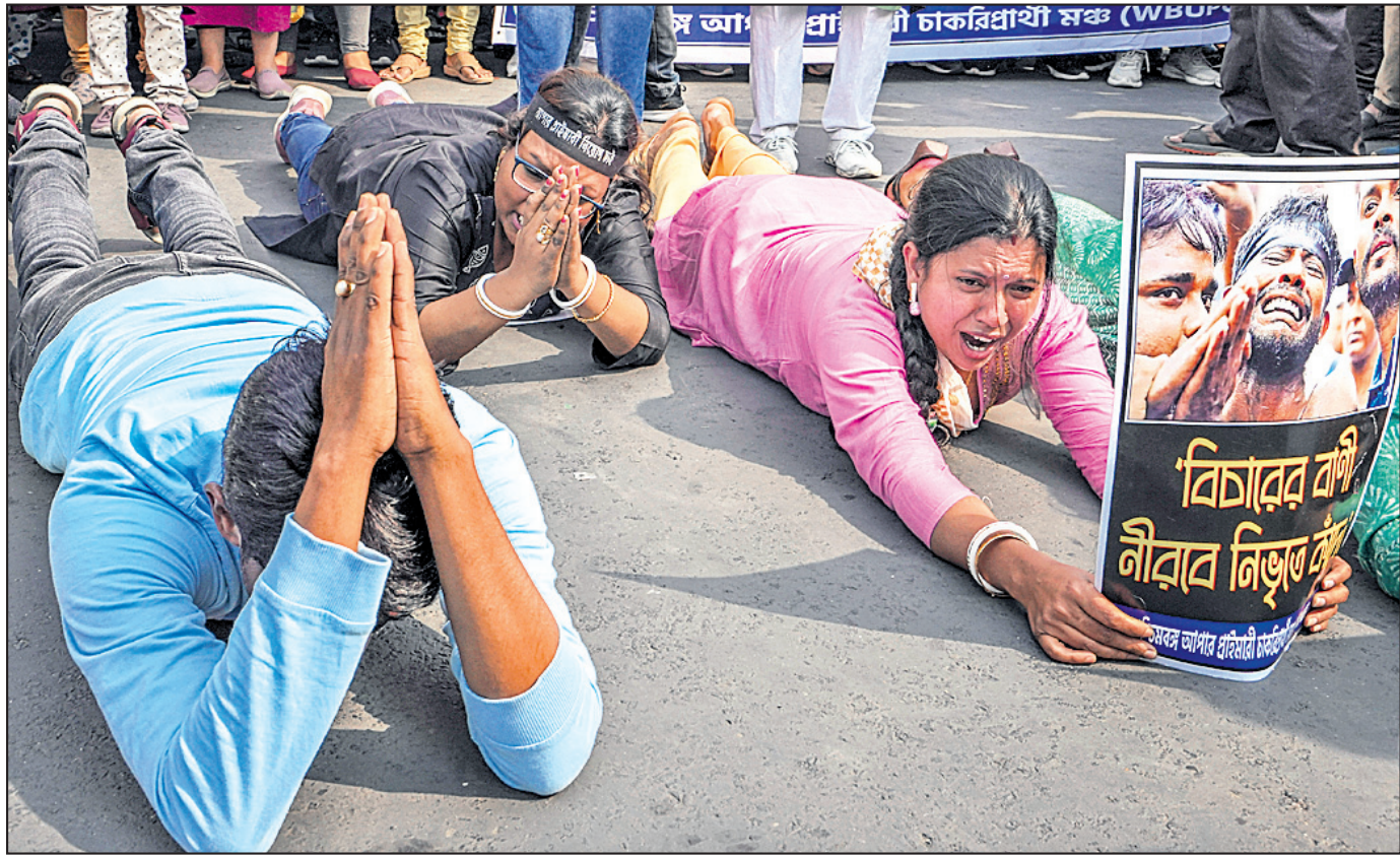
Upper primary teachers' aspirants stage a demonstration demanding their recruitment in Kolkata