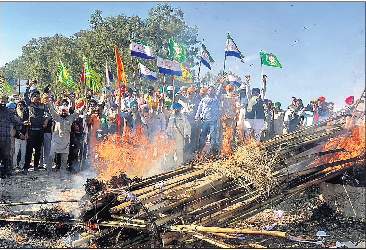
Farmers holding flags shout slogans against corporate houses during a protest, as part of their 'Delhi Chalo' march, near the Punjab-Haryana Shambhu border, in Patiala district of Punjab