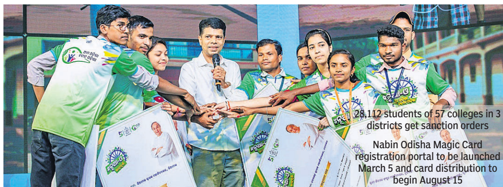
28,112 students of 57 colleges in 3 districts get sanction orders Nabin Odisha Magic Card registration portal to be launched March 5 and card distribution to begin August 15

Under the initiative, male students will get ₹9,000 annually, while female students will re-