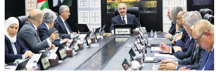
Palestinian Prime Minister Mohammad Shtayyeh convenes a cabinet meeting in Ramallah, West Bank