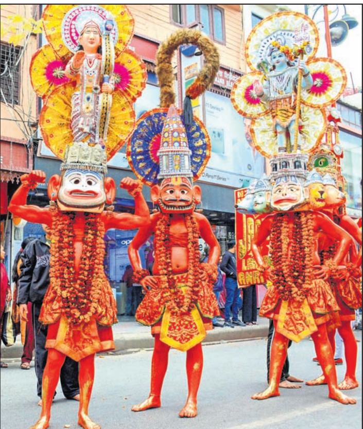
Devotees dressed as Lord Hanuman pose for photographs as they take part in a procession in Amritsar