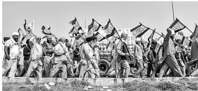
Nearly 90% farming households have less than two hectares of land holding. How can their income growth keep pace with national GDP growth?

tributed under the National Food Security Act.