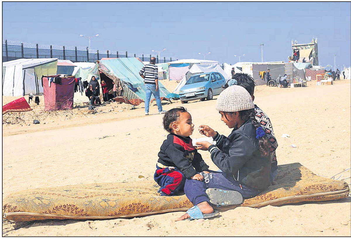
A displaced Palestinian girl, who fled her house due to Israeli strikes, feeds her brother at a tent camp, near the border with Egypt, in Rafah, southern Gaza Strip