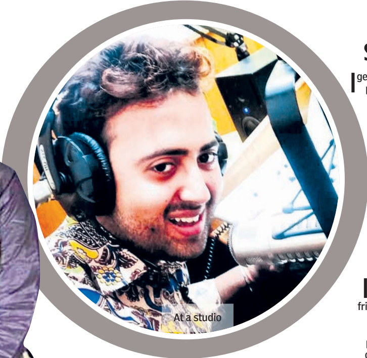
At a studio