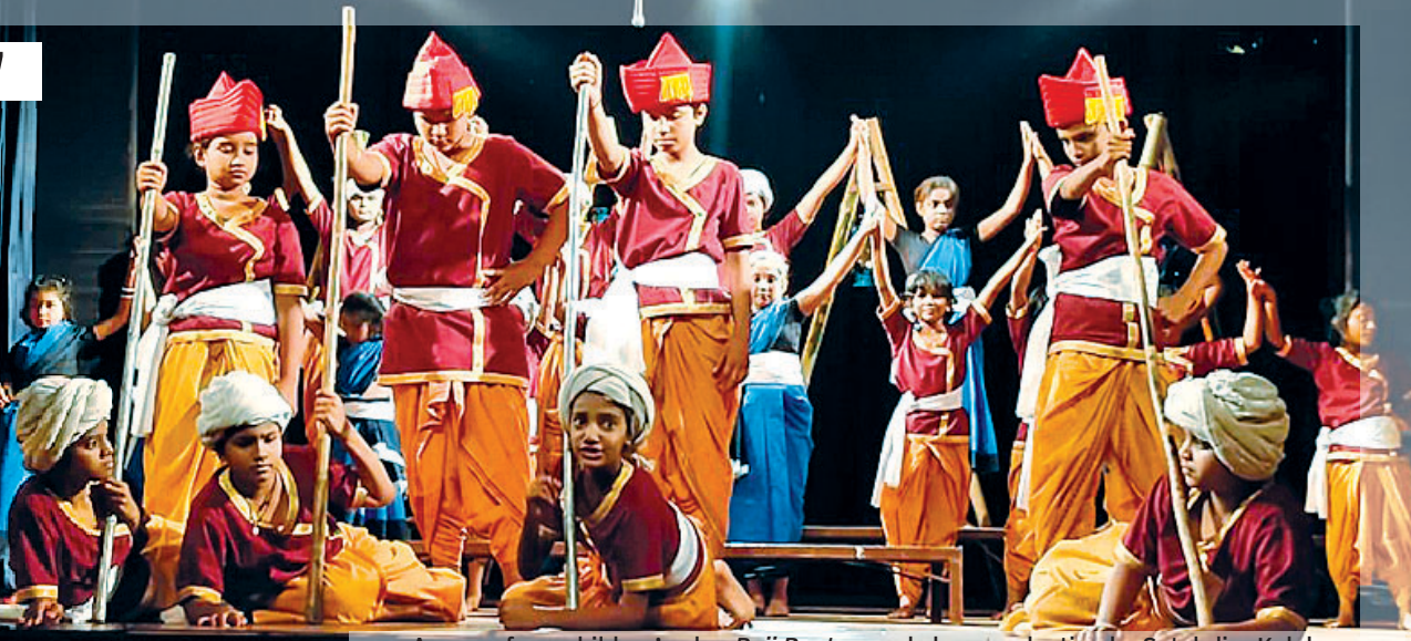
A scene from children's play Baji Rout , a workshop production by Satabdira Kalakar