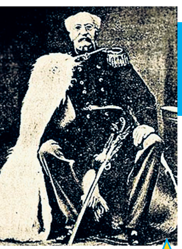
Russian imperial army general Grigory Zass