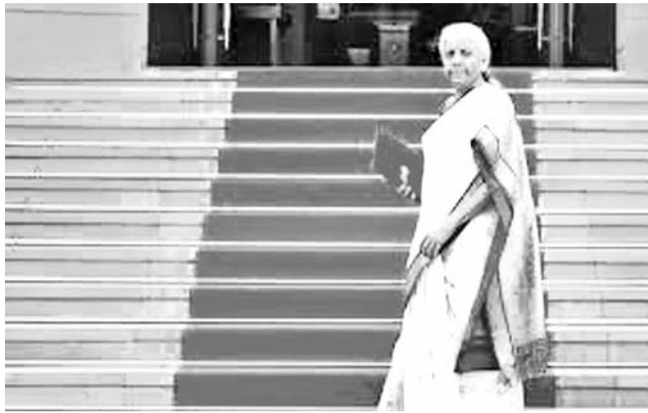
A failure of mass level job creation has become the biggest elephant in the room for muted consumption and hence for the ability to grow at a sustained 7%+ for the next 25 years

creation. Other than being hobbled by onerous bureaucratic compliance and regulations, one of the key reasons for these small enterprises not being able to scale up (and integrating into supply chains of medium and large corporates) has been a lack of access to formal credit. Interest rates on loans from money lenders were exorbitant. The action plan in the Budget "formulates a package covering financing, regulatory changes and technology support, to help them grow and compete globally." A key component is a credit guarantee scheme for manufacturing MSMEs as well as a self-financing guarantee fund. There are other incentives to increase bank loans to this segment (including higher MUDRA loan limits, better working capital management, etc.)