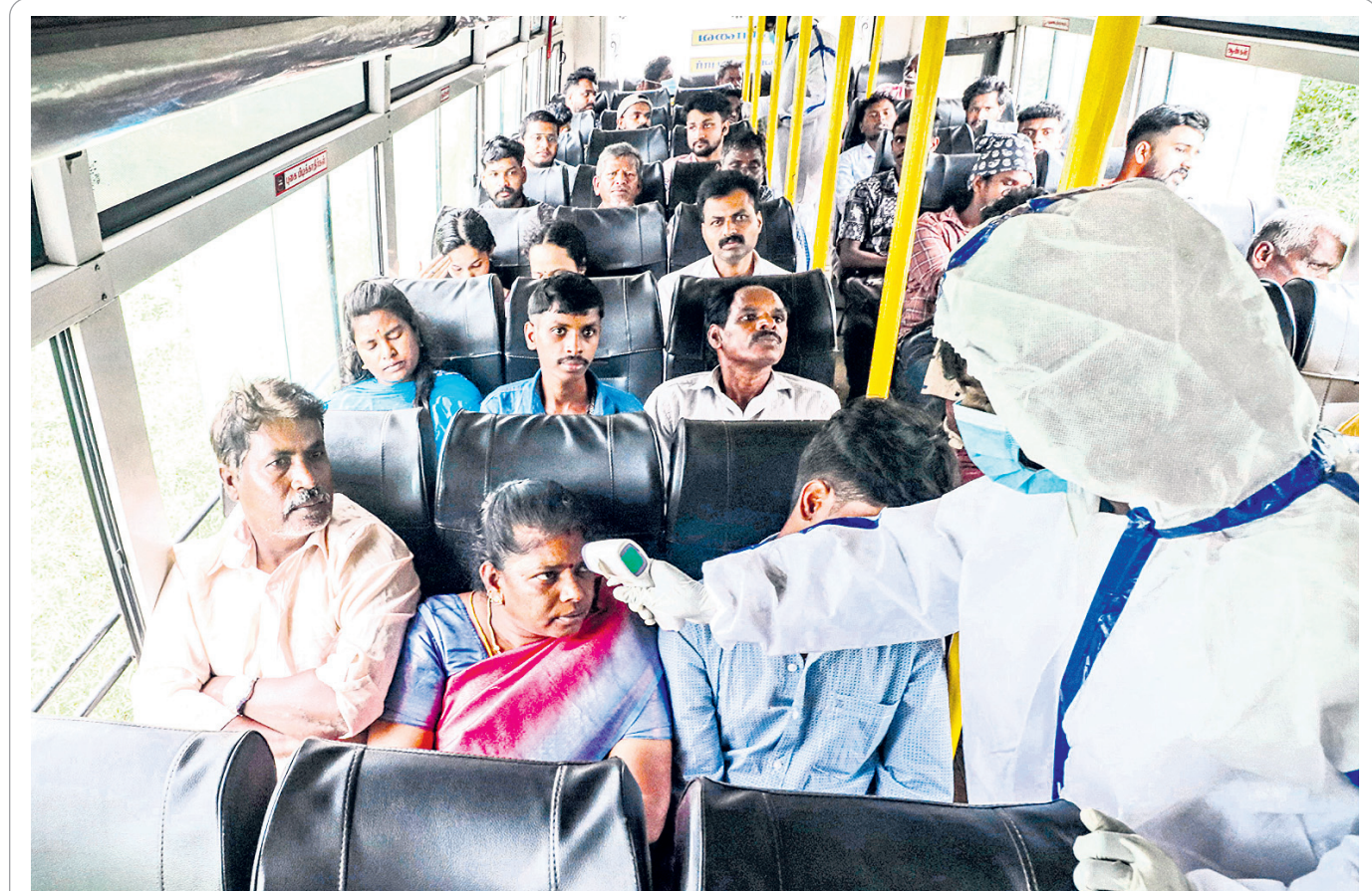
PREVENTION IS BETTER THAN CURE: Tamil Nadu health workers check the temperature of passengers as a bus from Kerala enters the state amid the spread of Nipah virus in Coimbatore

"The plaintiff was appointed to IRPS in 2021. The purpose of posting the impugned social media posts in 2024 and in the language they have been posted do not appear to be bonafide," it noted.