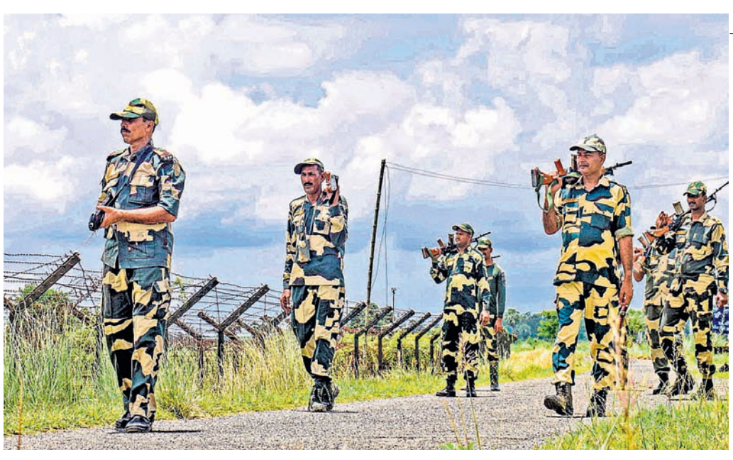
Border Security Force (BSF) personnel keep vigil along the India-Bangladesh Border, in Dakshin Dinajpur district of West Bengal, Tuesday

"Two people were found to have been infected with this mosquito-borne disease in the Bally Municipality area and the remaining five people were from different rural areas of the district," he added.