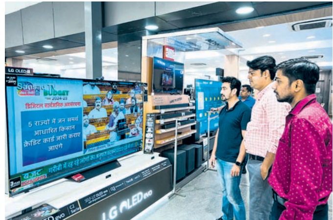
People watch live telecast of the Union Budget presentation by Finance Minister Nirmala Sitharaman

Congress president Mallikarjun Kharge termed the Budget a "copycat" and alleged that it is not for the progress of the country but to save the Modi government.