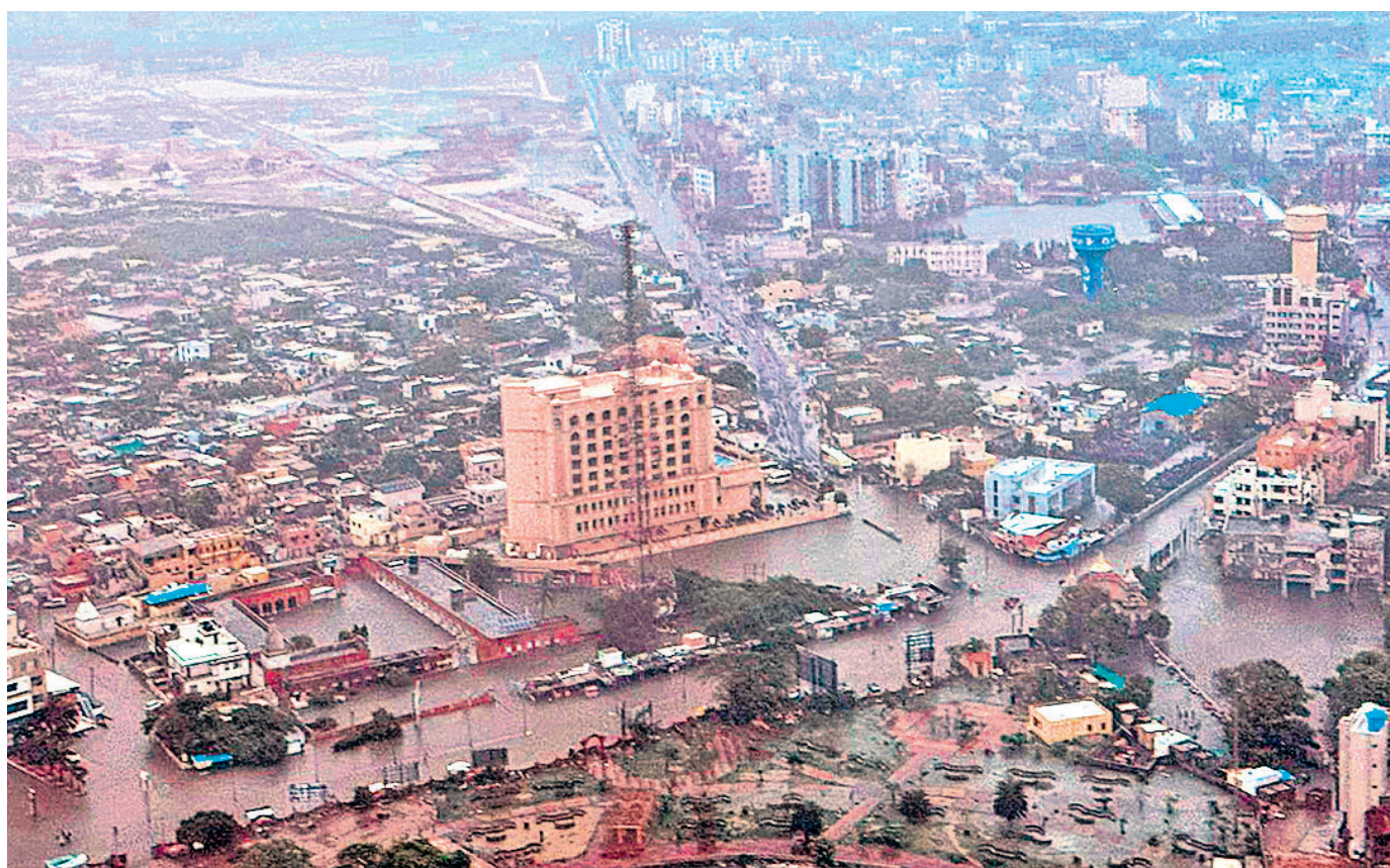
FLOOD WOES: A flooded area of Gujarat's Saurashtra region following heavy monsoon rains