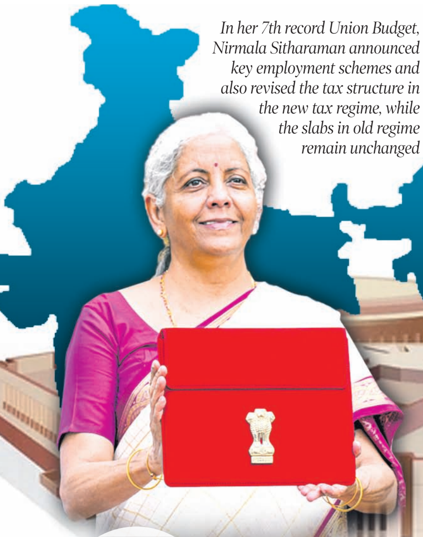
In her 7th record Union Budget, Nirmala Sitharaman announced key employment schemes and also revised the tax structure in the new tax regime, while the slabs in old regime remain unchanged