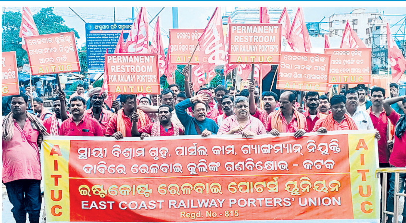
UP IN ARMS: Members of East Coast Railway Porters' Union stage a demonstration in front of Cuttack railway station, Tuesday, seeking fulfillment of their various demands

He instructed the RTO officials to file a prosecution report against the heads of educational institutions if they are found using vehicles for transportation purpose without valid fitness certificates and other required documents.